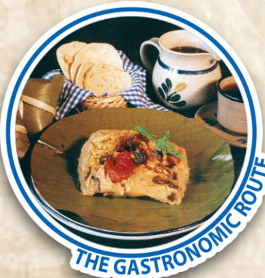
THE GASTRONOMIC ROUTE

▲ The Caribbean Route is a tourist experience that promotes the multi-ethnic culture and nature of the Autonomous Regions of the Caribbean Coast of Nicaragua. This route offers cultural and nature tourism, sun and beach, ecotourism, community tourism, scientific tourism, and aquatic activities such as diving, snorkeling, sport fishing and sailing competitions. Some places to visit are Bluefields, Corn Island, Little Corn Island, numerous cays off the mainland, Greytown, Sandy Bay Sirpi, Green Point and Monkey Point.