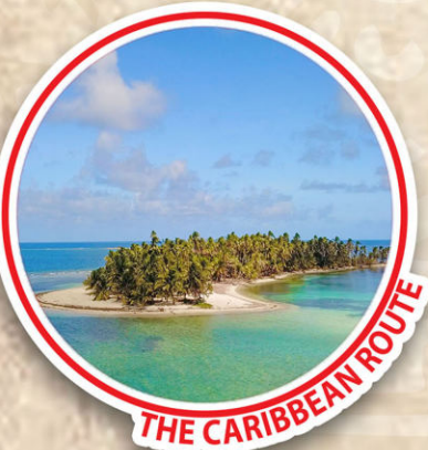
THE CARIBBEAN ROUTE

▲ The Beach Route is perfect for those looking for relaxation and fun in the sun. This circuit covers several departments, including Chinandega, León, Managua, Carazo and Rivas. Tourists can enjoy a wide variety of activities, from surfing and sport fishing to whale watching and scuba diving. Some highlights of this route include Juan Venado Island, San Juan del Sur Beach, Popoyo Beach and the Estero Padre Natural Reserve.