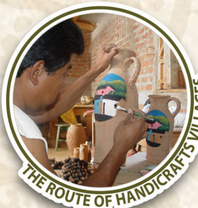
THE ROUTE OF HANDICRAFTS VILLAGES