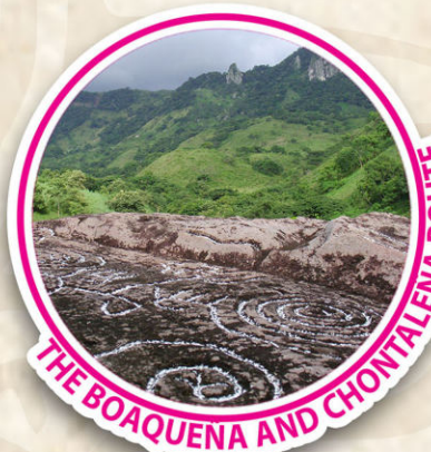
THE BOAQUEÑA AND CHONTALEÑA ROUTE