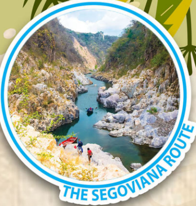
THE SEGOVIANA ROUTE