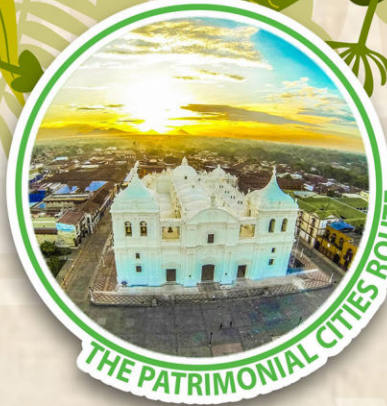
THE PATRIMONIAL CITIES ROUTE