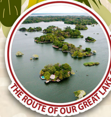
THE ROUTE OF OUR GREAT LAKE COCIBOLCA

▲ The Segoviana Route offers a full touristic experience in the departments of Estelí, Madriz and Nueva Segovia, with a rich cultural and natural diversity that includes geoparks, mountains, handicrafts and indigenous communities. You can do nature, historical and rural tourism and ecotourism in places of interest such as the rosquilla's shops, petroglyphs, waterfalls, museums and marble artisans.