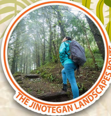
THE JINOTEGAN LANDSCAPES ROUTE