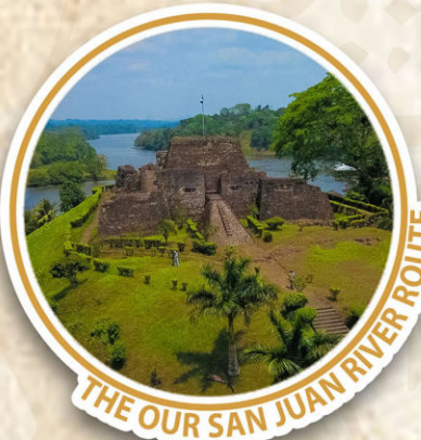
THE OUR SAN JUAN RIVER ROUTE