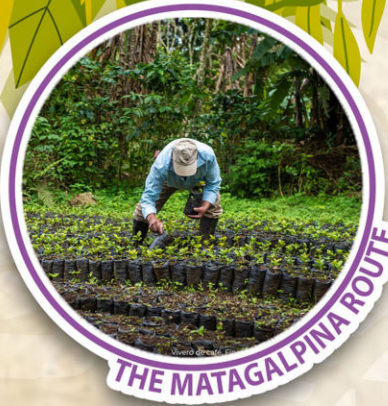
THE MATAGALPINA ROUTE