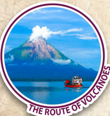
THE ROUTE OF VOLCANOES

▲ The Route of Our Great Lake Cocibolca offers a relaxing experience with different ecosystems and landscapes, home to many species and local customs. Along the route you can enjoy nature, culture, ecotourism, sports and rural tourism. It includes places such as Ometepe Island, the Islets of Granada, the Solentiname archipelago, and Los Guatuzos Wildlife Refuge, among others.