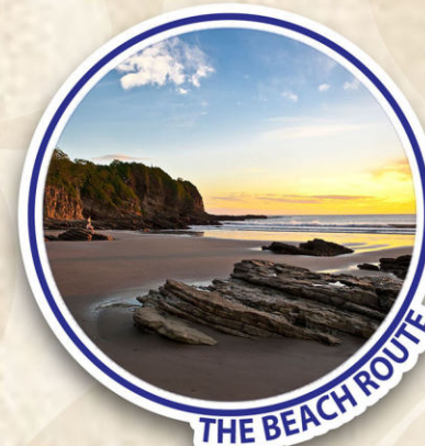
THE BEACH ROUTE

▲ The Route of Volcanoes is an exciting experience that goes through the departments of Chinandega, León, Managua, Masaya, Granada and Rivas. With a wide network of tourist services, this route focuses on adventure tourism, ecotourism, nature tourism, health and wellness, scientific and rural community tourism. Among its attractions are the Masaya Volcano National Park, the Cerro Negro volcano and the Tiscapa Crater Lake.