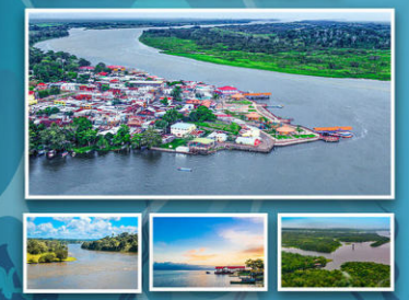
THE OUR SAN JUAN RIVER ROUTE